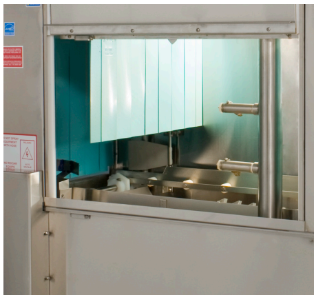
Telescoping Doors — The doors provide wide access to the interior of the machine for quick and efficient daily maintenance.