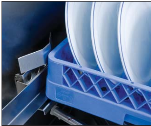
RackAware™ Automatic Rack Sensing System* only runs a cycle when a rack is present