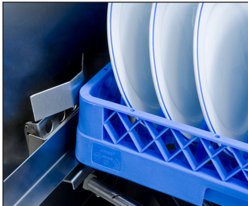
RackAware™ Automatic Rack Sensing System* only runs a cycle when a rack is present